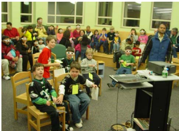
Kids of all ages enjoy the Opportunity rover and the Solar System in 3-D at Lawrence Elementary.