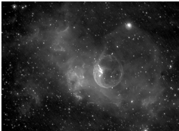
H-alpha view of the Bubble Nebula