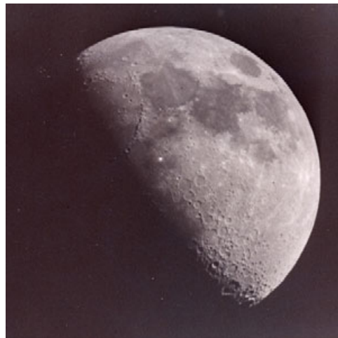
The TLP is the small, bright spot in the center of the image.