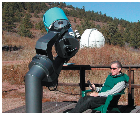
16" LX-200 & 24" R-C dome at Star Hill

and, for example, M33 as a naked eye object! The picture below shows the observing deck with a 16 inch Meade LX-200, and in the background the observatory dome housing a 24 inch fast