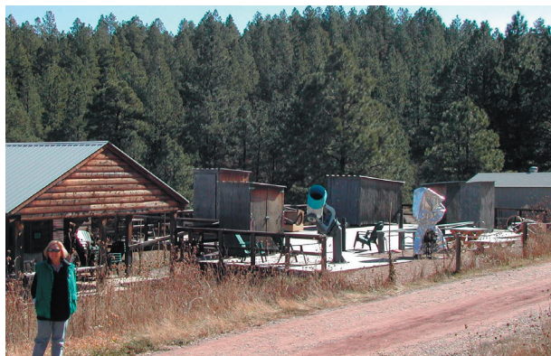
A Visit to The Star Hill Inn, near Las Vegas, NM