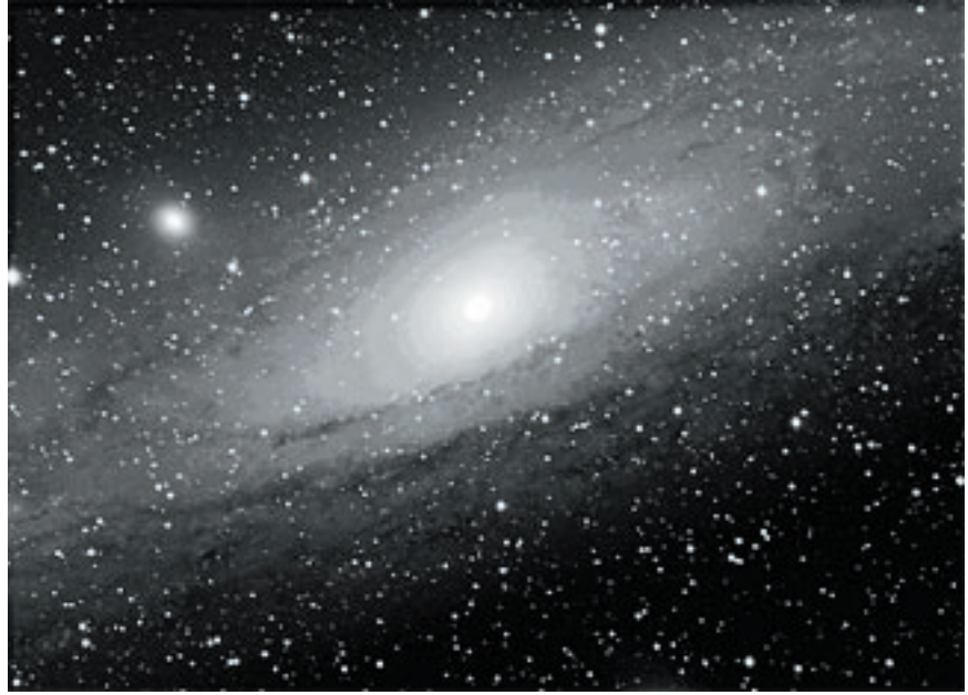
M31, the Great Galaxy in Andromeda, with M32 at upper left. Photo by RA Parker using Tak FC-76 refractor at f/8 and SBIG ST-10XME.