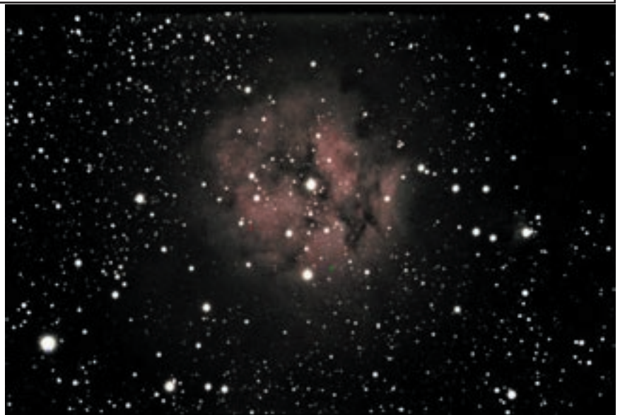
IC-5146, the Cocoon Nebula in Cygnus

SBIG ST-10XME and C11 at f/6.3 using a G11 equatorial mount. Exposure times were 24/16/12/12 minutes (L/R/G/B).