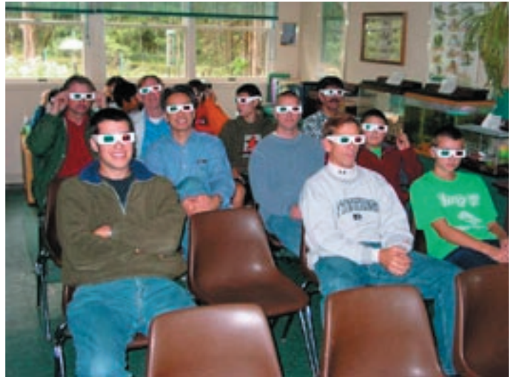
Boy Scouts and More: Imagining Alien Creatures in Martian Rock formations at the Wash Crossing Nature Center on 30 Sept.