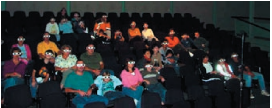
The Solar System in 3-D at World Space Week