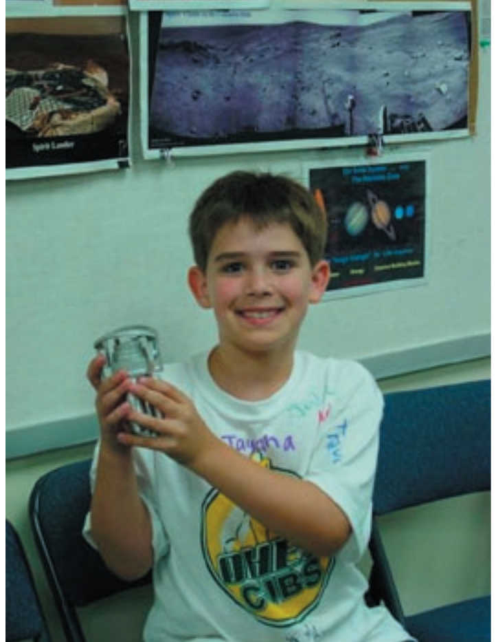
Future Martian explorer plans a command sequence for the RAT Science Drill on Mars: 12 Jun 2006 at Orchard Hill Elementary

Starquest: Hope Conference Center, NJ, June 23-25. Although observing was washed out by rain at the 17<sup>th</sup> annual AAAP star party, the attendees were treated to a feast of wide ranging