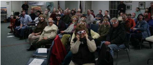
Hardy Upstate New Yorkers of all ages wowed by Victoria Crater on Mars in 3-D at the Barneveld Municipal Center on March 9, 2007.

Mohawk Valley Astronomical Society (MVAS): Utica, NY. On March 9 and 10 the MVAS club hosted me for a thrilling weekend of astronomy outreach. First up was a Friday evening talk on Mars to a SRO crowd of over 70 at the Municipal Center in Barneveld, who offered up great hospitality. Saturday began with my "Blast Off for Space with NASA" event at the Children's Museum in Utica, and concluded with my presentation at the MVAS annual dinner banquet on "Exploring Mars and the Search for Life (in 3-D)". All in all, I was quite gratified to find such enthusiasm for astronomy in beautiful upstate NY despite several feet of snow cover!