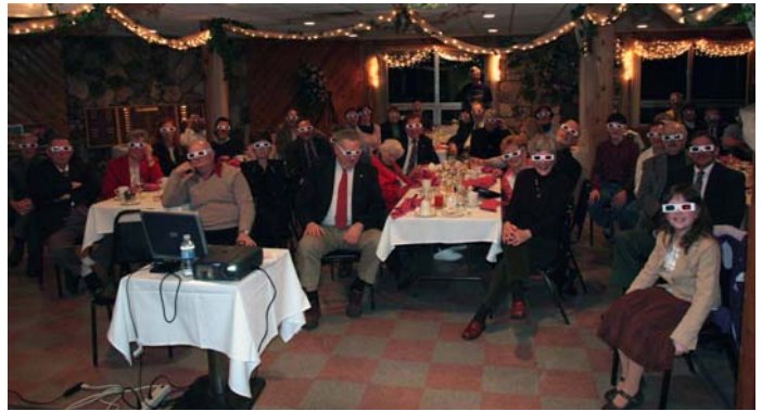
Martian Cuisine at the MVAS Annual Dinner Banquet on March 10, 2007.