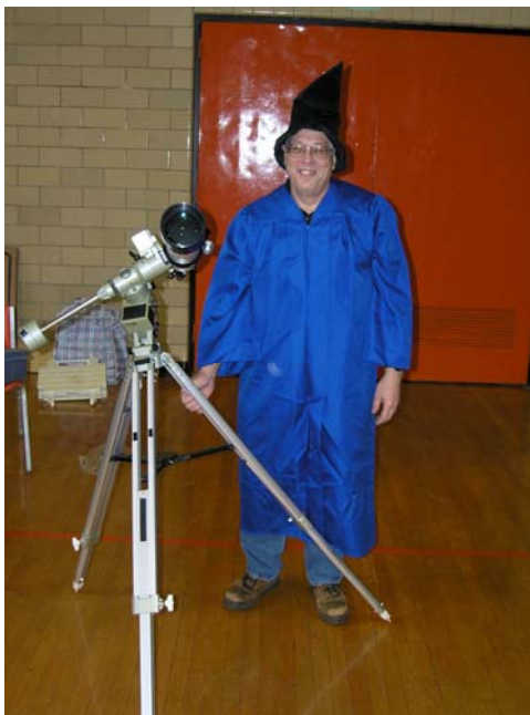
The AAAP wizards at work!