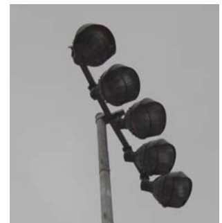
Old lighting fixtures at the Scotch Rd fields (left) and New anti-glare shielded luminaires (right)