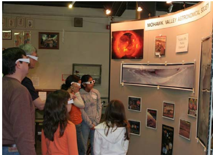
Kids enjoy Giant 3-D Craters on Mars posters from JPL as we "Blast Off" at the Children's Museum in Utica NY on March 10.

Online pictures here: http://www.museum4kids.net/AstronomyNASA.htm