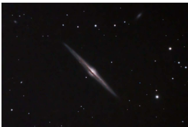
Brian Van Liew

Also known as the Needle Galaxy, NGC4565 is one of, if not the best example of an edge on galaxy. Located in the constellation Coma Berenices, it lies some 30 million light-years distant and is over 100,000 light-years in diameter. I went down to a dark site in south Jersey known as Coyle Field to take this. While shooting it I spent my time doing visual observing with another scope. This night was unusually warm and dew free which was a pleasure to deal with for a change. In the eyepiece NGC4565 is just a long thin gray ghostly line but after letting the camera do its thing the edge on dust lane starts to show more and more detail as the central bulge starts to glow yellow. This picture has one and a half hours total time consisting of 8 and 12 minute sub exposures. The camera was a Canon 350D with an IDAS LP filter, which was attached to an 8" F6.3 SCT OTA.