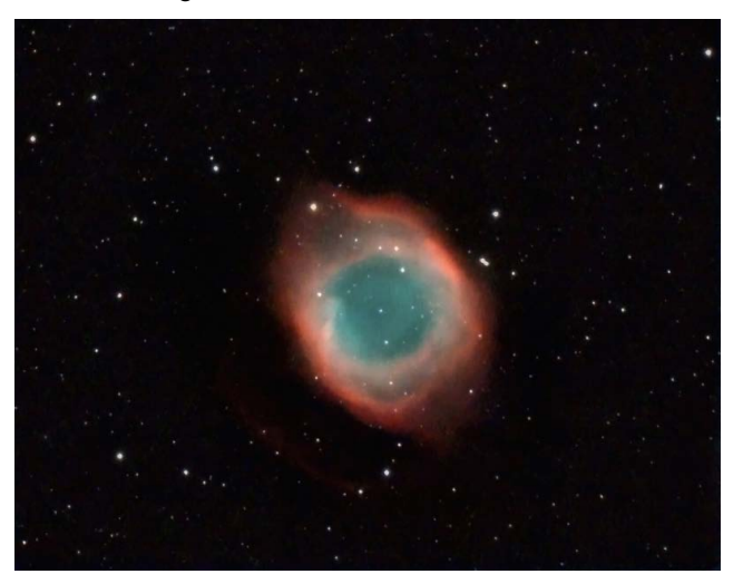
Brian Van Liew

Also known as the Helix Nebula. This is a close example of a planetary nebula with us having the advantage of looking into it. Located in Aquarius the Helix lies some 700 light years away and spans 2.5 light years. Visually this object can best be seen with the aide of an OIII filter with low power on a scope. It can be seen this time of year in the south and doesn't get very high up before dropping back down to the horizon. This picture was taken from a dark site I visit frequently called Coyle Field in south Jersey which is less than an hour and a half from Princeton. Equipment used was a modified Canon 350D with a 0.8x FF/FR through a Meade 8" F6.3 SCT OTA. The final image shown is composed of 21 eight minutes subs using an ISO800 setting.