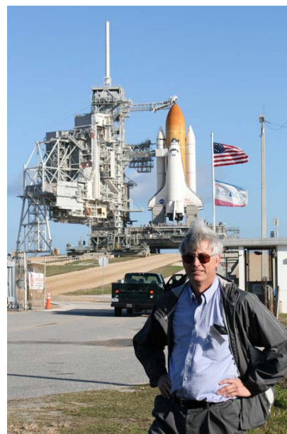
Endeavour and Ken Kremer at Pad 39 A prior to Feb 8, 2010 launch from KSC.